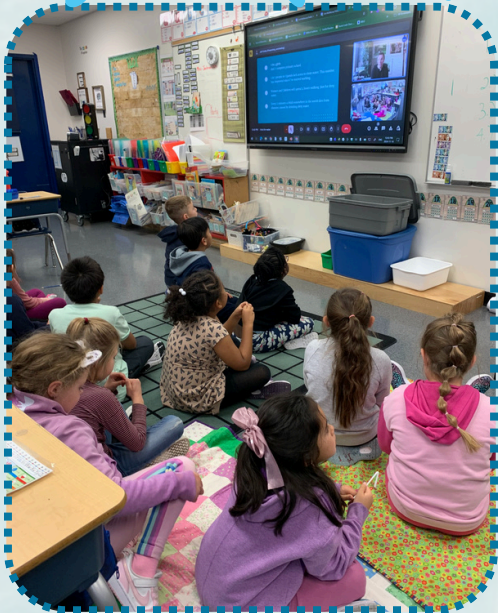
Google meet with Acts for water.