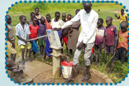
Google meet with legacy water foundation.